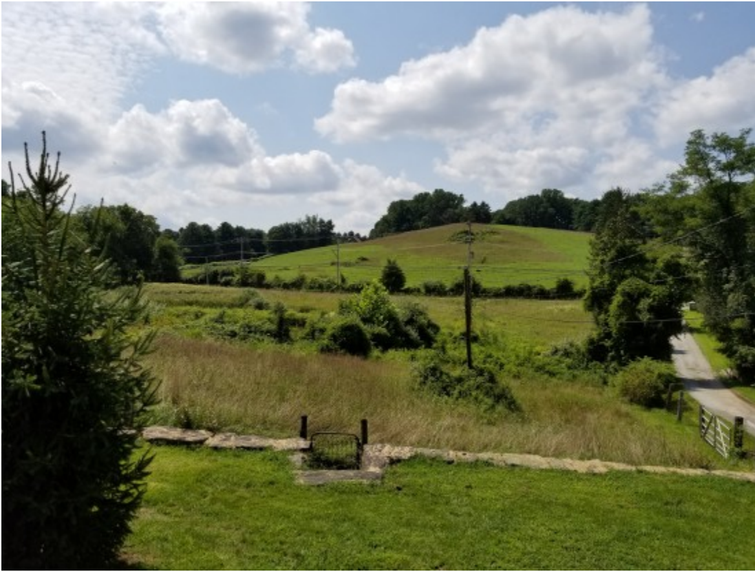
The view today of Kuerner's Hill from Kuerner Farm.