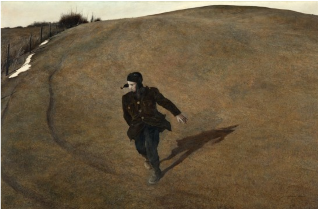
Andrew Wyeth, Winter 1946, 1946, Tempera on panel, North Carolina Museum of Art, Raleigh, NC.