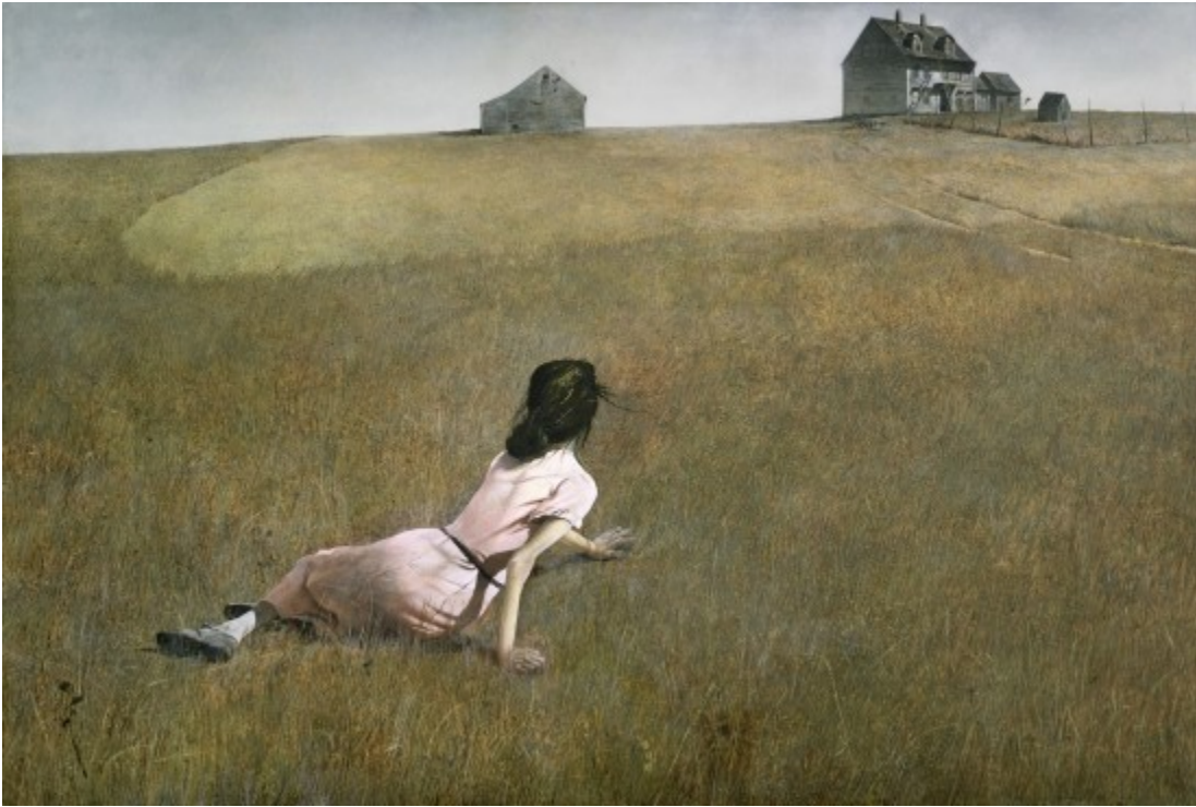
Andrew Wyeth, Christina's World, 1948, Tempera on panel, The Museum of Modern Art.

Wyeth's painting of a woman crawling up a weedy hill towards a forlorn house has itself moved up, from hanging outside one moma restroom to another. Christina's World is these days found surrounded by a constellation of information desks, elevator banks, escalators, and baby-changing areas. Yet the public still seeks it out, for its celebrity as well as its strangeness—lingering, as I observed, over the painting's details long after taking the requisite photograph.