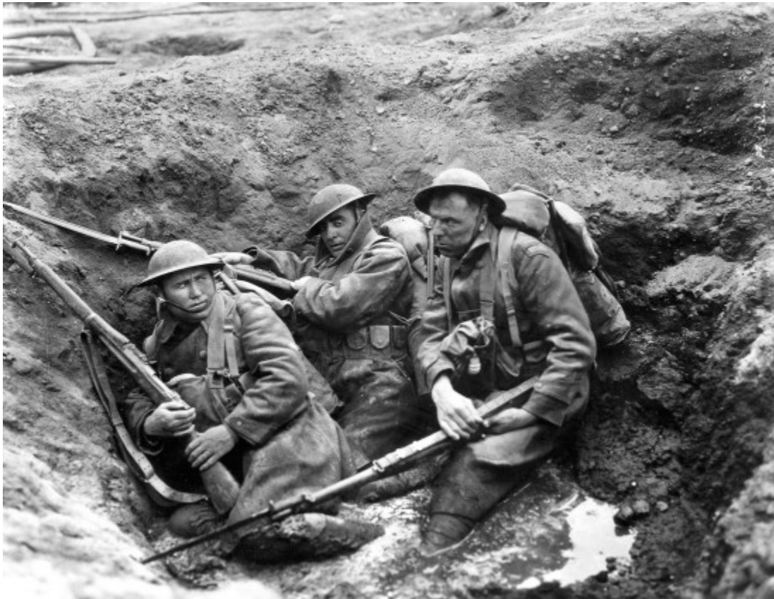
Still from King Vidor's The Big Parade.

Take another famous Wyeth hill, Winter 1946 (1946), this one in the current exhibition: Same tawny colors. Same sharp ridgeline and depth of field. Same mysterious figure in the foreground—this time, a boy twirling down. Even the same tire tracks cutting through the grass. The actual location Wyeth depicted here is Kuerner's Hill, across from Kuerner Farm. But the reality of its shapes and colors is unrecognizable when compared to the painting—despite, again, Wyeth's persistence of supposed detail.